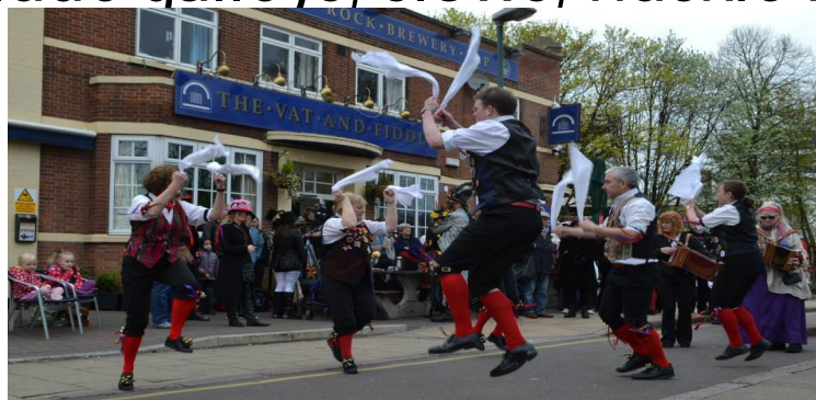
Lady Bay Revellers