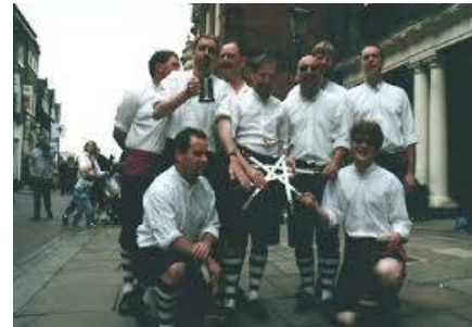
Stone Monkey (Rapper)