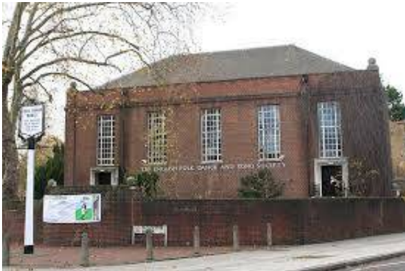
Cecil Sharp House