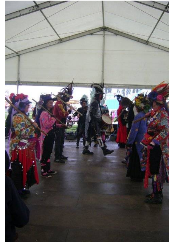
Black Pig Border