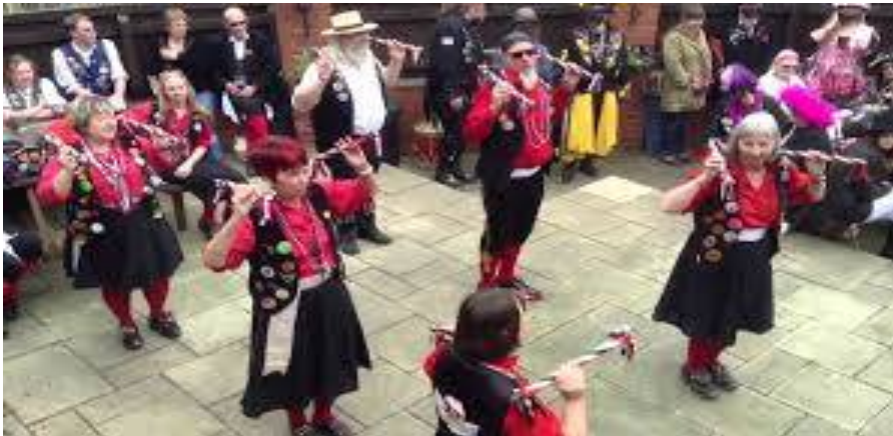
Sergeant Musgraves Dance