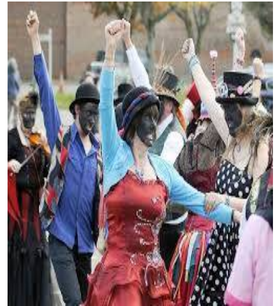
Ouse Washes Molly